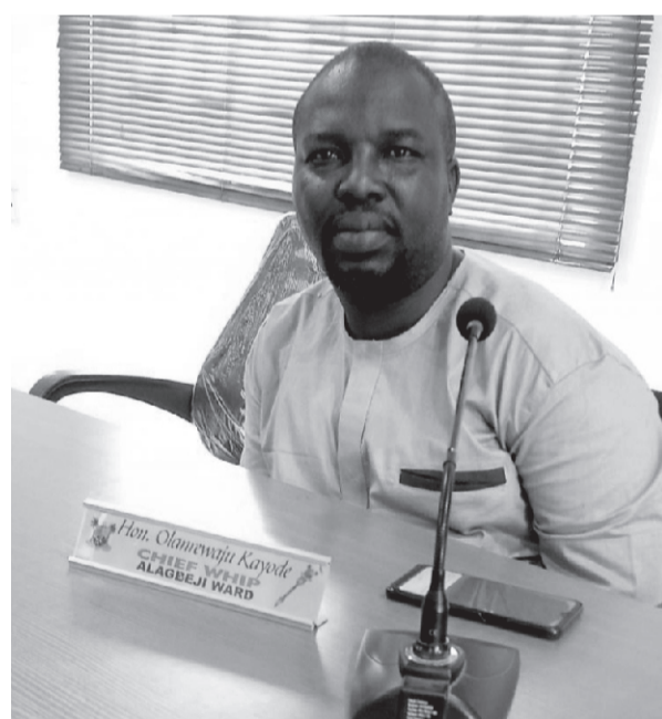
Hon. Olanrewaju Kayode

"In addition, the state government will begin the renovation of Alabe Street very soon. Hundreds of residents benefited from the stimulus packages organised by the local and state governments during the lock down, more than a thousand benefitted when Knorr organised its own.