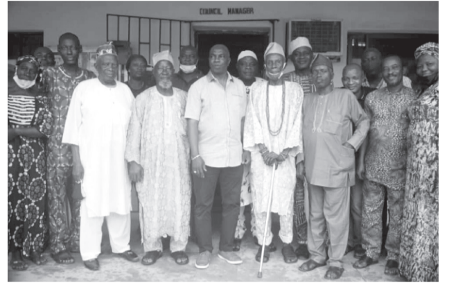
Isolo LCDA chairman with the concerned citizens of Ilasamaja

He, therefore, advised leaders and other stakeholders in Ilasamaja to embrace the path of unity and cohesion, adding