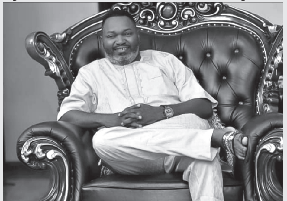
Hon kehinde oloyede

and not build a political arsenal that will throw our community into political disarray. Thanks and God bless." It is believed that one cannot win election without the backing of some party stakeholders. Who among the stakeholders are backing you?