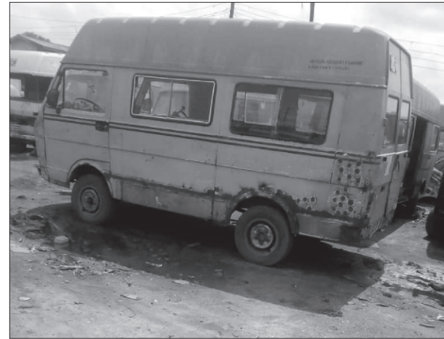
Some of the abandoned vehicles at Oboye, Oboye pipeline CDA

"We are going to abide by the CDA's directive on the so termed abandoned vehicles. I will personally monitor and make sure all the vehicles According to him, there is are cleared off the