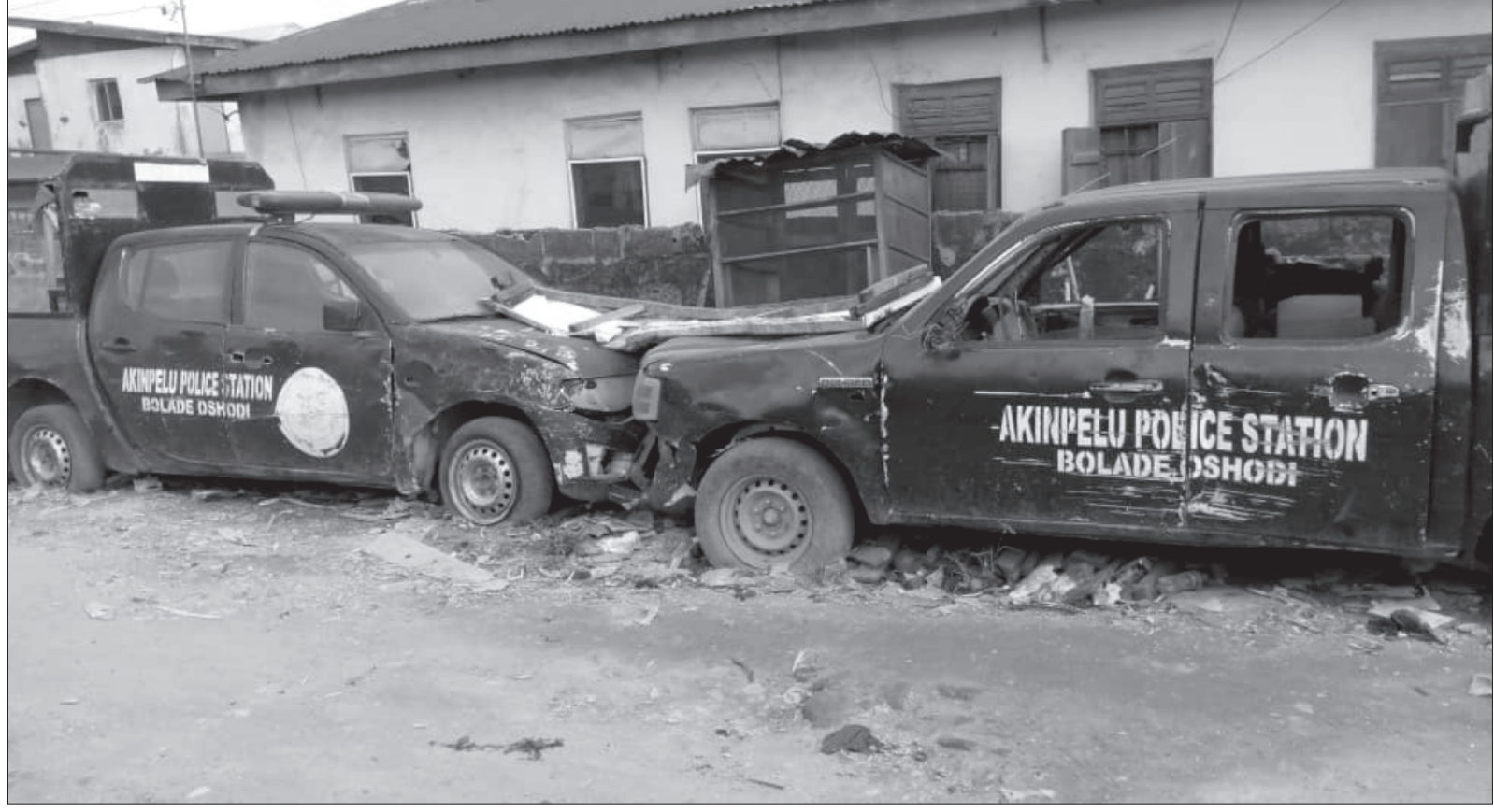
Akinpelu police vehicles abandoned on olasumbo street that prevents LAWMA activities in the community

Information contained in the letter stated that two police vehicles belonging to Akinpelu police abandoned on Olasumbo/Akinpelu streets prevents LAWMA from performing their statutory functions of picking up community refuse and denying other vehicles access to the streets.