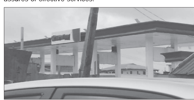
Westglow filling station

He said the company would invest in the host community by offering job opportunities and equipping residents.