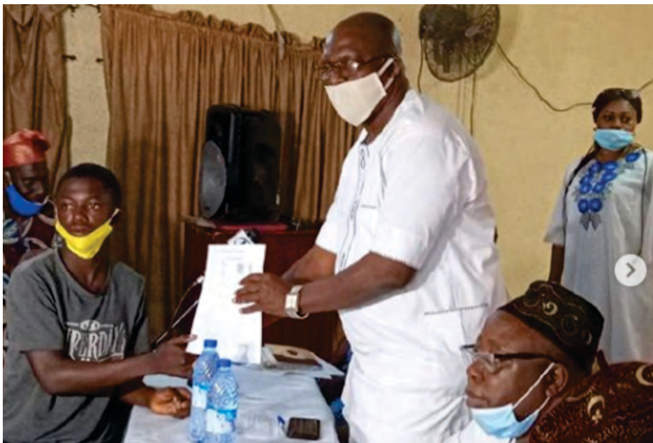
A beneficiary receiving his form