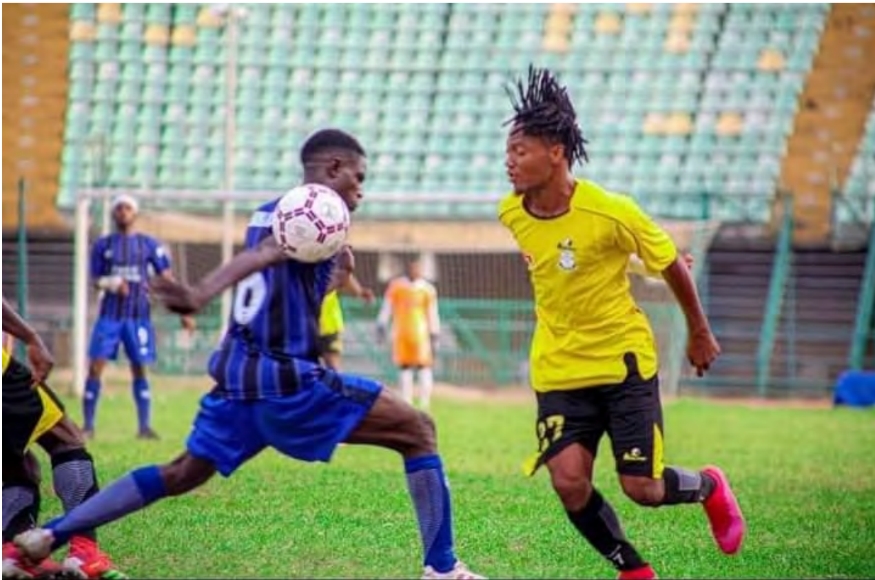
Smart City vs Gbagada FC NLO 1