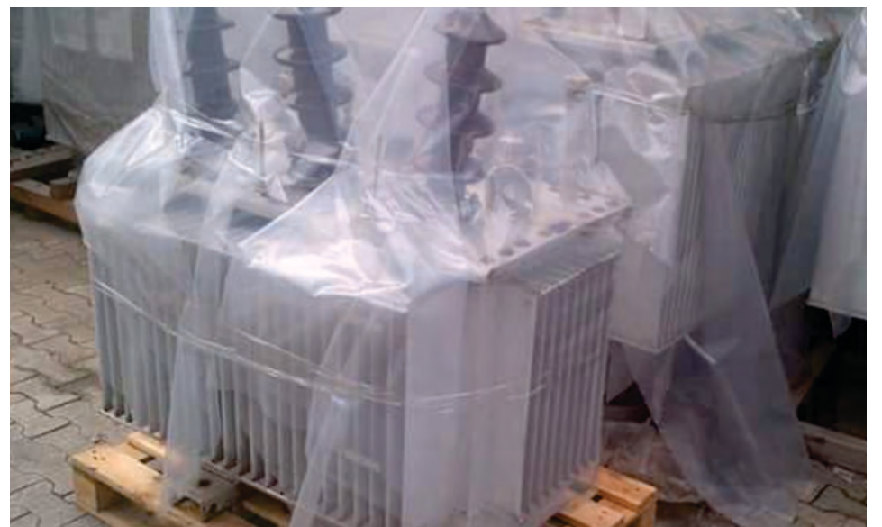
A new transformer