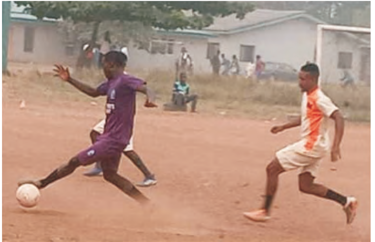
Diadem Stallion FC vs TCN FC

While speaking with ECHONEWS, he said he was delighted with his performance, hoping to build on the momentum going forward to secure the league title for Diadem Stallion FC.