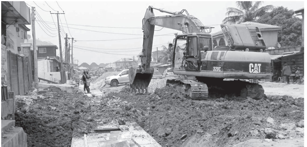
Ongoing construction of drain collector in Community Road, Oke-Ogbere

In the same vein, community leaders in Akinbaiye and