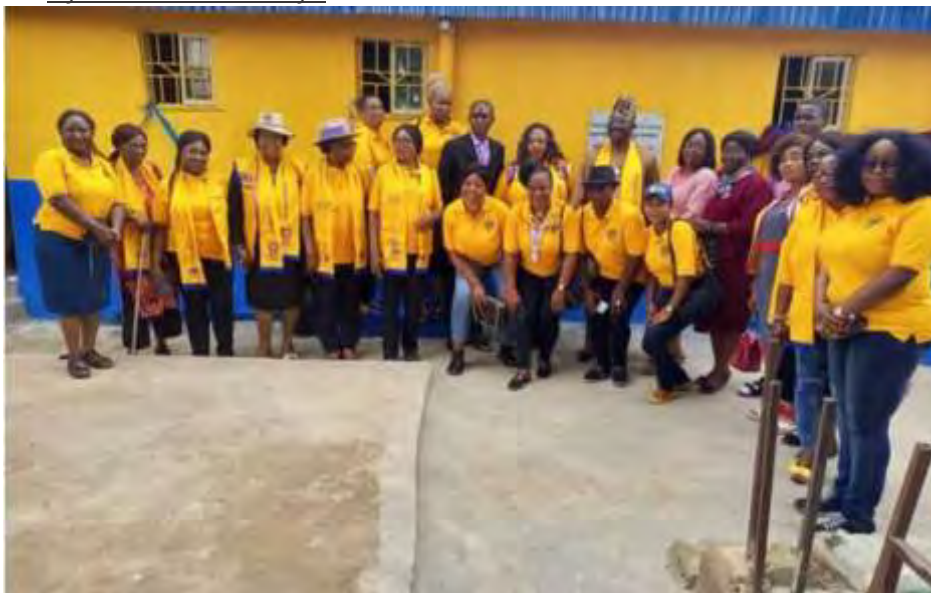
Ikeja Lions Club

I keja Golden Lions Club has constructed and commissioned an eight-unit toilet facility for Baptist Senior Secondary School, Obanikoro, Lagos.