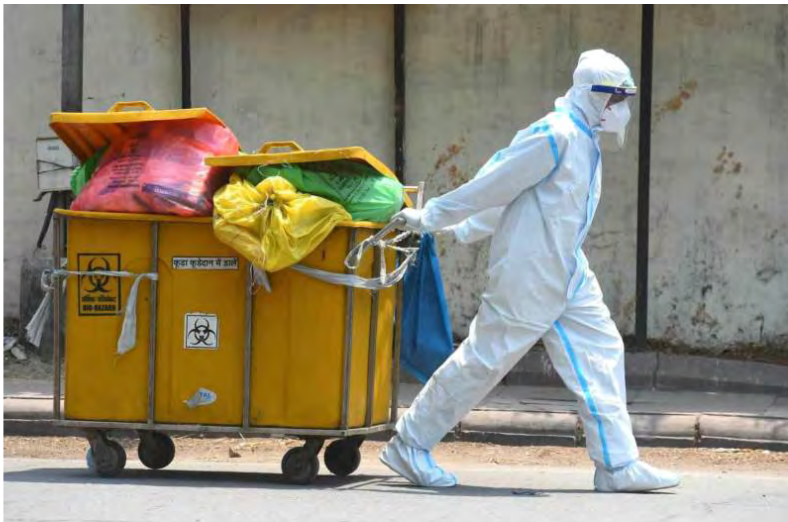
Disposing Medical Waste

He recalled that the initial draft report was presented earlier in the year after incorporating various views, opinions and recommendations, adding that it became worthy to have a validation workshop to obtain sign-off from the