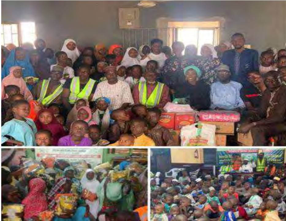
Orphanage home in appreciation mood

The orphanage and similar childcare Foundation in Agege has appreciated philanthropist's support and assistance in taking care of the less privileged, especially at the concluded Eid-ul Kabir celebration. The management of the orphanage home thanked the donors of food items for making