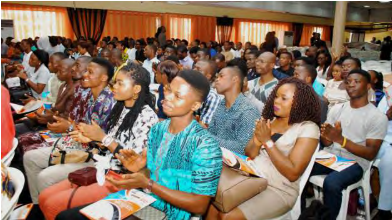
Youths at the training