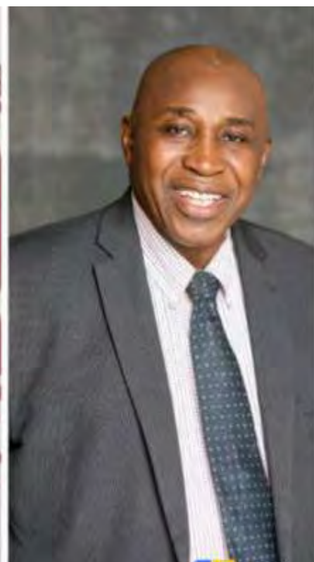
Hon Rasheed Shabi