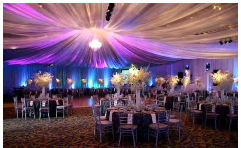
An event centre

"We cannot overemphasise the importance of event safety, especially during the upcoming Sallah Celebration. We urge all event owners and organisers to prioritise the