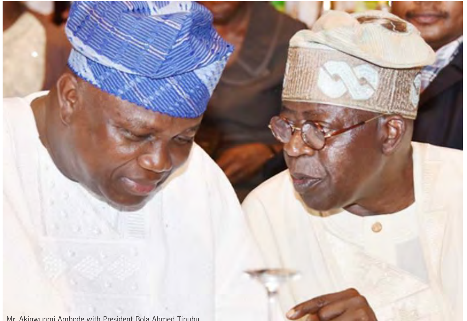
Mr. Akinwunmi Ambode with President Bola Ahmed Tinubu

Like a storm from nowhere, a groundswell of opposition suddenly gathered momentum from the ranks of the party apparatchik who feared that the governor had assumed too much political power due to the shift of Tinubu's