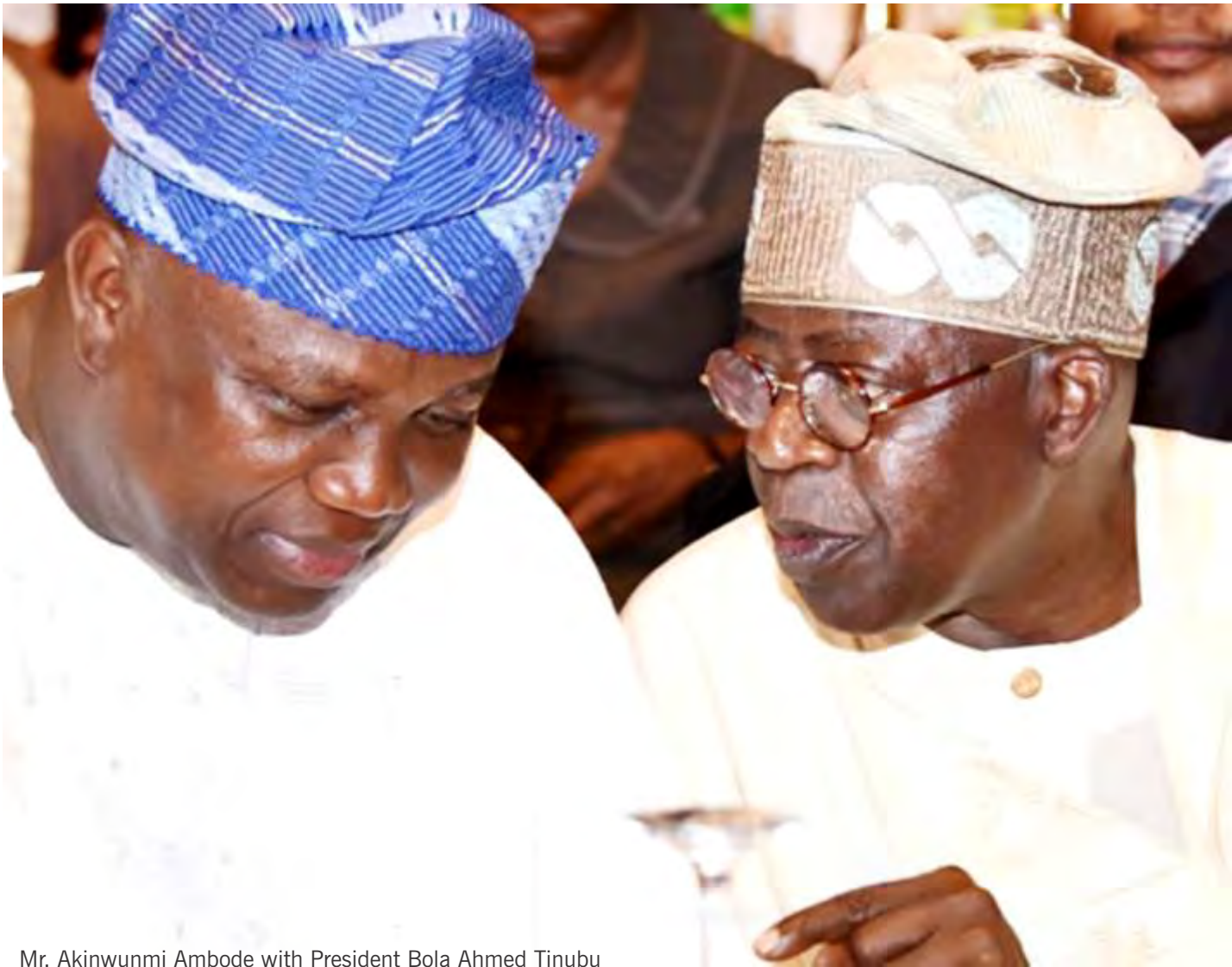
Mr. Akinwunmi Ambode with President Bola Ahmed Tinubu

Fear Grips Lagos Motorists Over Vehicle Ownership Certificate