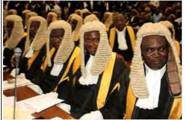
Senior Advocates of Nigeria

The Governor of Lagos State, Mr. Babajide Olushola Sanwo-Olu has called on some Nigerians not to cast aspersions on the Judiciary no matter how they feel about the outcome of the legal process and the last general elections. Mr. Sanwo-Olu stated this at the annual conference of the Nigerian Bar Association, Section of Public Interest and Development Law, NBA-SPIDEL with the theme "Post-Election Nigeria: The Judiciary in the Eye of the Storm".