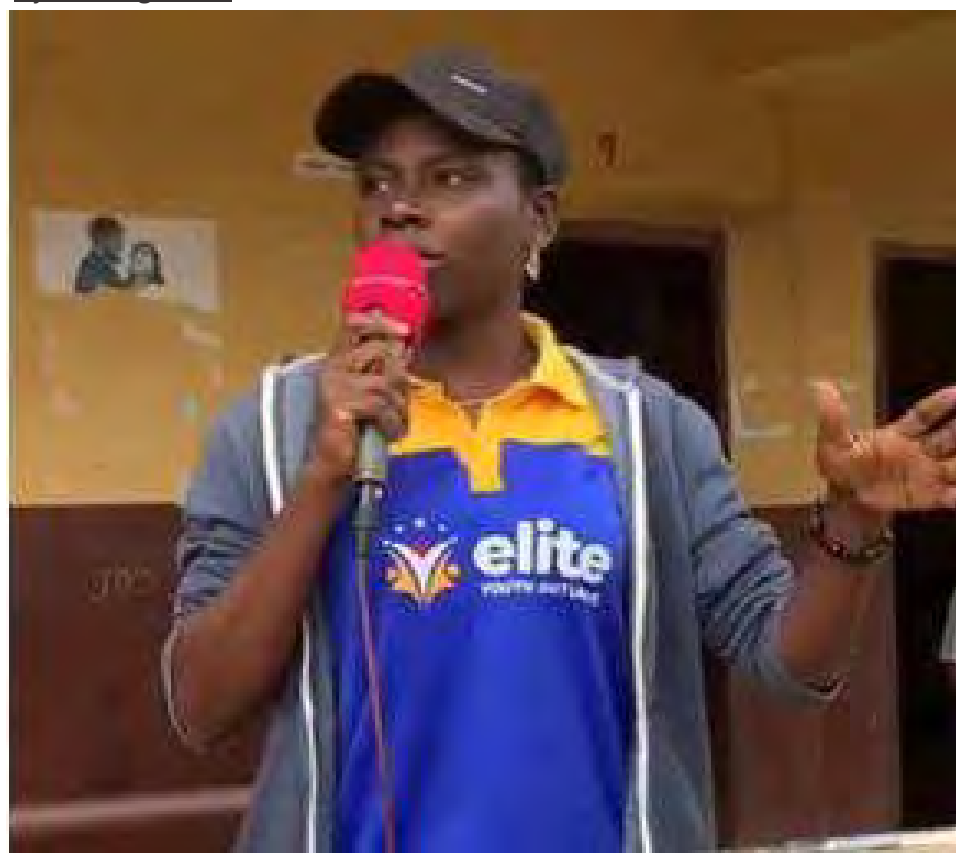
Elite youth Initiative instructor while teaching in Community High school orile-Agege

Female Students of the Community High School, Orile-Agege have expressed their gratitude towards the Elite Youth Initiative for giving them sanitary towels after being educated on puberty hygiene. Hundreds of sanitary pads were given to them.