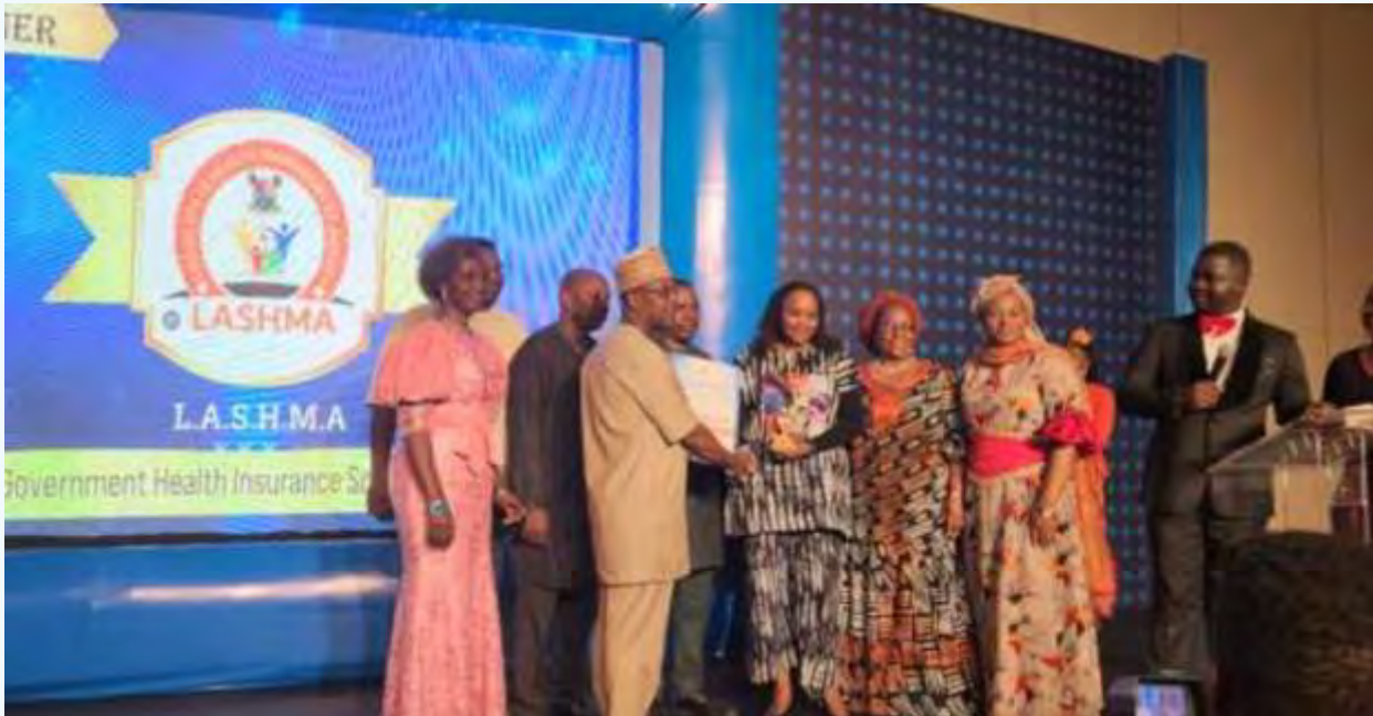
At the presentation of the award