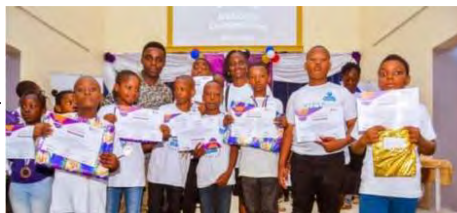
Chess, Scrabble Competition winners