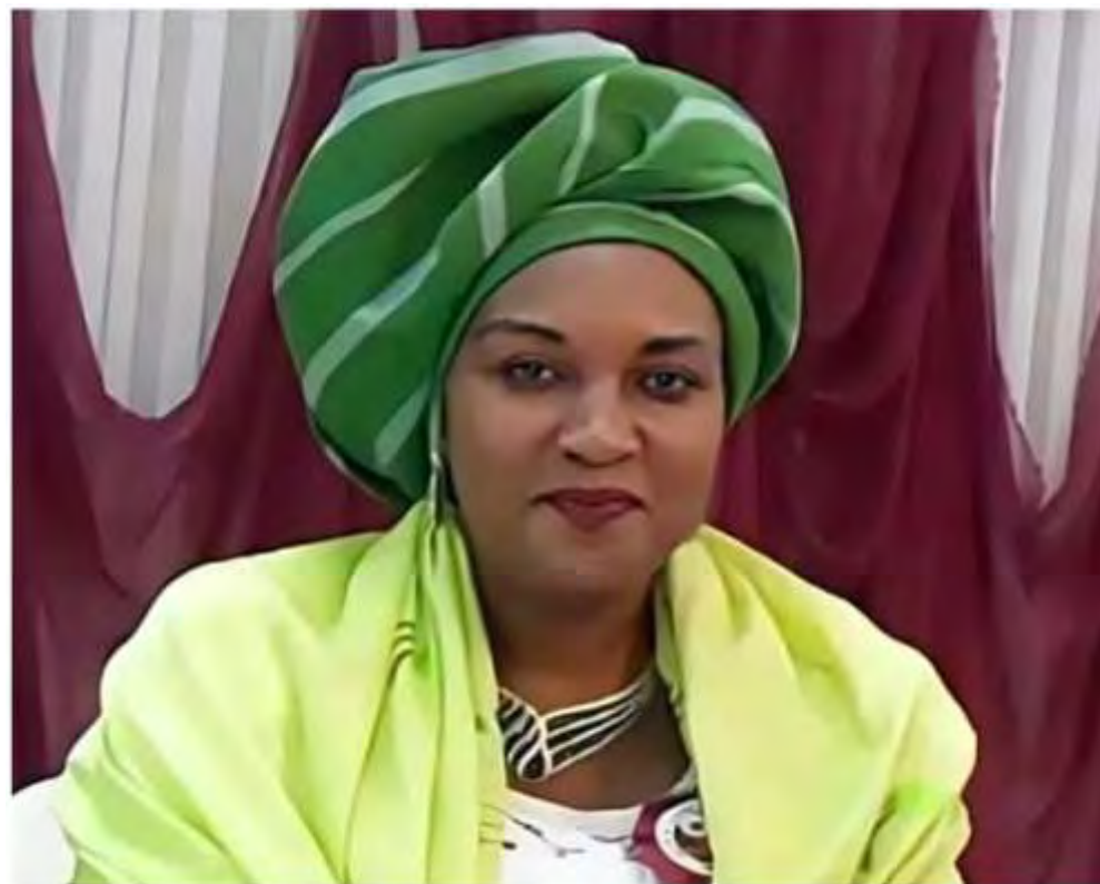
Hon. Folashade Oba