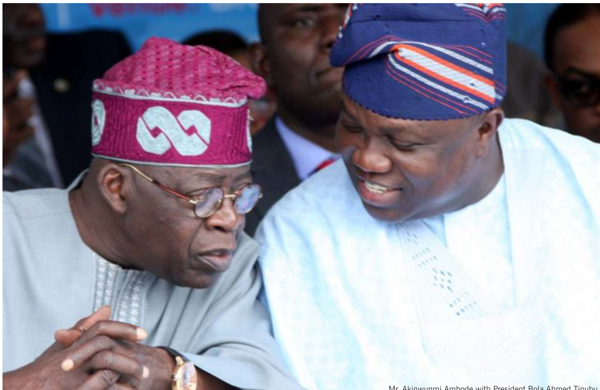
Mr. Akinwunmi Ambode with President Bola Ahmed Tinubu

They said the party leaders in the state also need to reconcile all aggrieved party members in local government areas across the state.