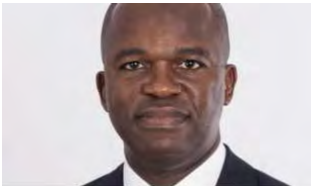
Senator Tokunbo Abiru

He said he was worried as a Managing Director