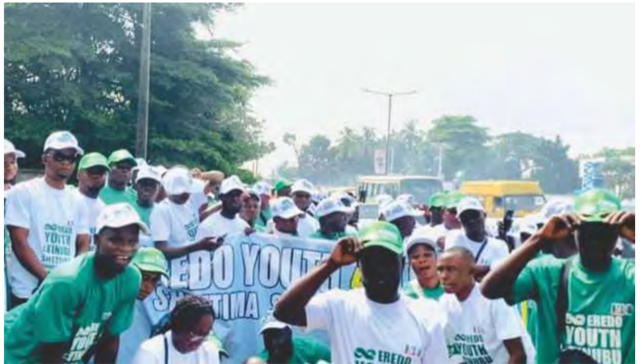
The mobilization exercise

He also pledged to take all necessary steps to ensure the success of APC at all levels.