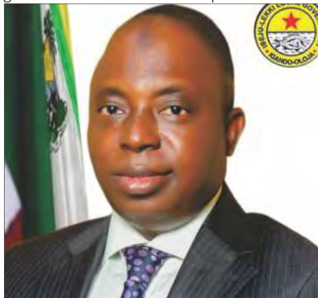
Hon. Abdullahi Olowa

both physically, emotionally, and mentally and sustain a good health status. Olowa revealed that the local government is presently investing in health sector by improving the quality of healthcare delivery through the provision of basic amenities and support system. He sought more private partnerships with the government in the healthcare and other sectors saying the unification of able factions is what will bring about community development.