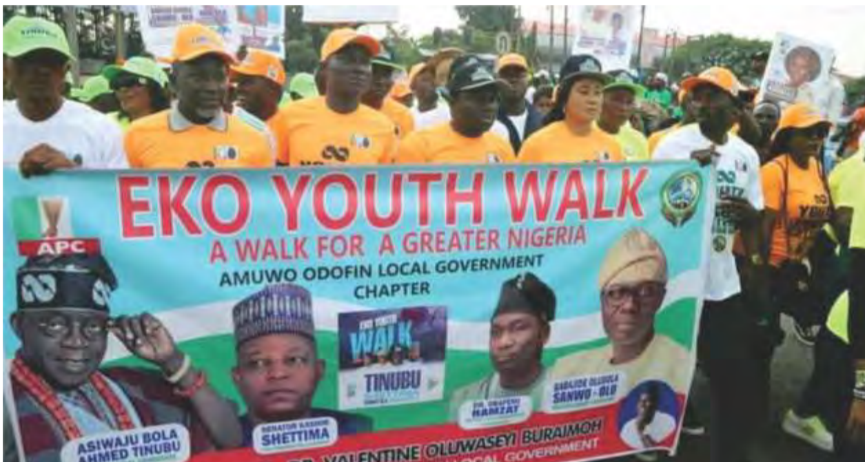
Youths campaigning for Asiwaju in Amuwo-Odofin LGA

noted that the party has been putting in efforts towards the emergence of each flag bearer which members should be in full support. He assured that flag bearers' manifestos are not empty promises because the party rules with the formula of continuity through dividends of democracy which is favourable to the public. He promised to continue to cater for the well-being of the people while urging them to get their voter's Cards ready ahead of the 2023 general election.