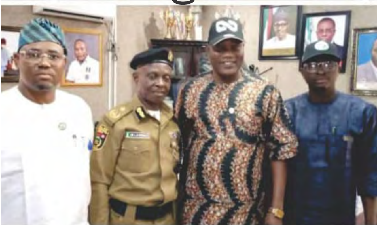
Ojokoro, NDLEA partners