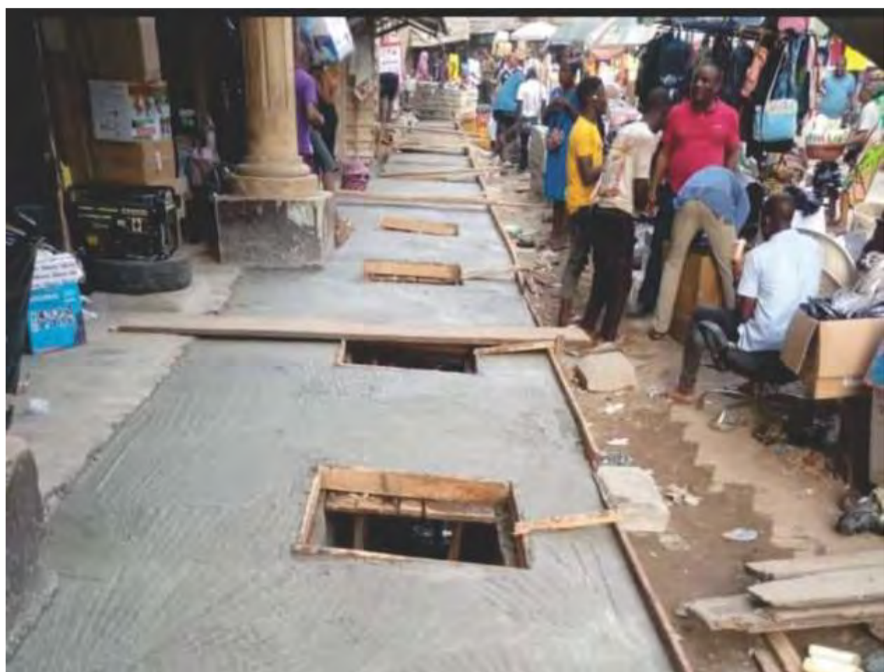
Drain on Ashogbon Street

been completed with drainage and interlocked stones. "We appreciate the co-operation and support of all residents and shop owners for their understanding, and we implore them to still bear with us as we strive towards the timely completion of the drainage."