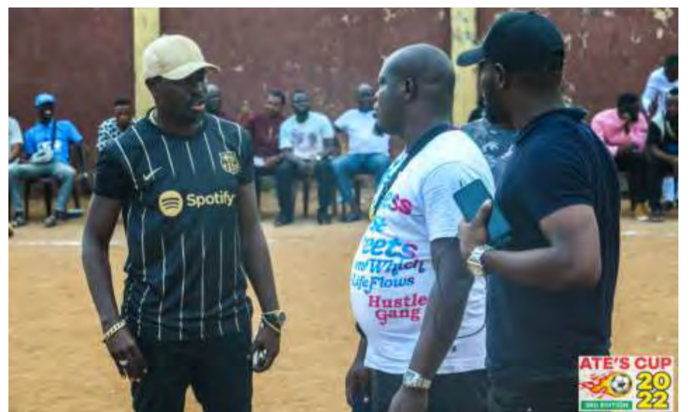
Ate's cup organizers

It took an helpless own goal from Legend FC to player for Oshodi FC to