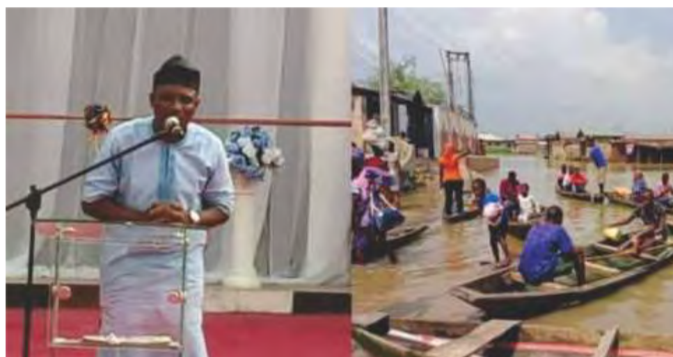
Ikosi-Isheri river site

Residents commended his quick response at the critical moment.