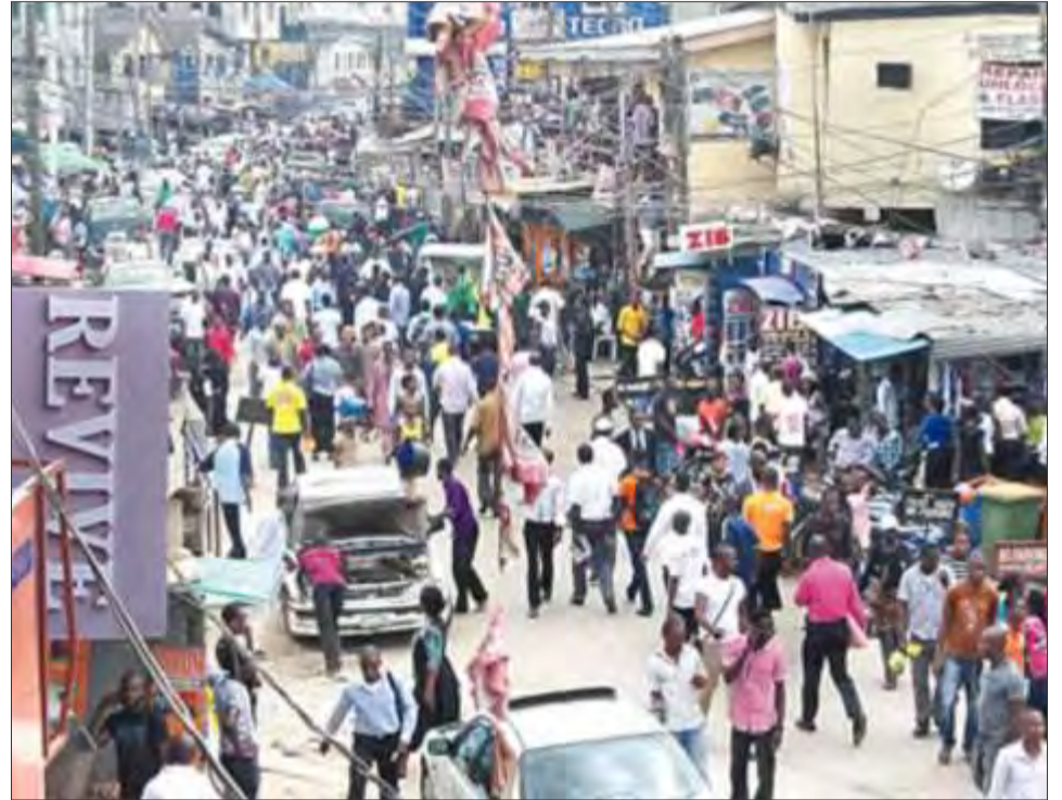
Alaba International Market