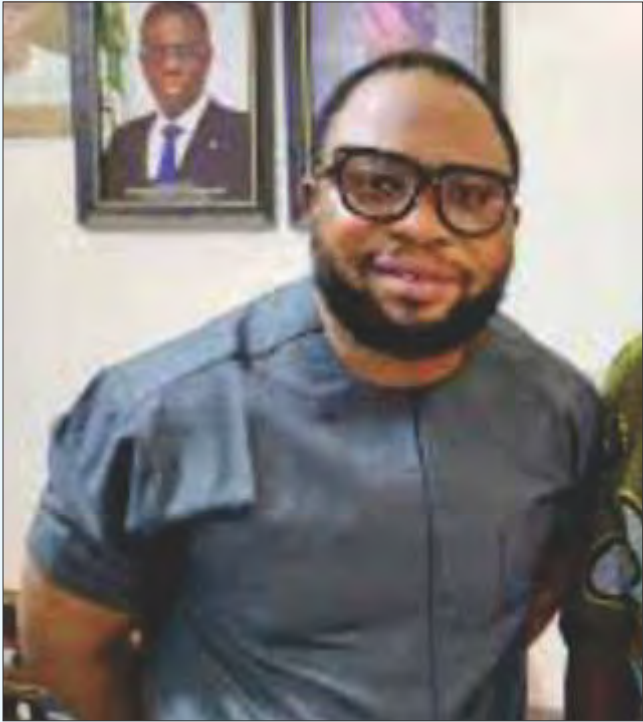
Prince Ajele Abayomi (Ikomdina)

of the party. In a meeting with party members recently, Ikomdina requested an individual to present their PVCs to show their commitment. He said all members should have collected their PVCs by now and carried out other necessary activities assigned by the party. He canvassed that all flag bearers of the party are worth propagating for as the party has never for once presented an inefficient leader for the masses.