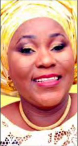
Hon. Ramotalai Hassan

measures put in place for the upcoming election due to its major event of the day. She promised to continue to ensure stability and community prosperity in the council.