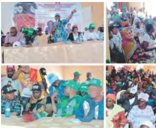
Photo combination of LASCOTA campaign assurance in Ojo Local Government