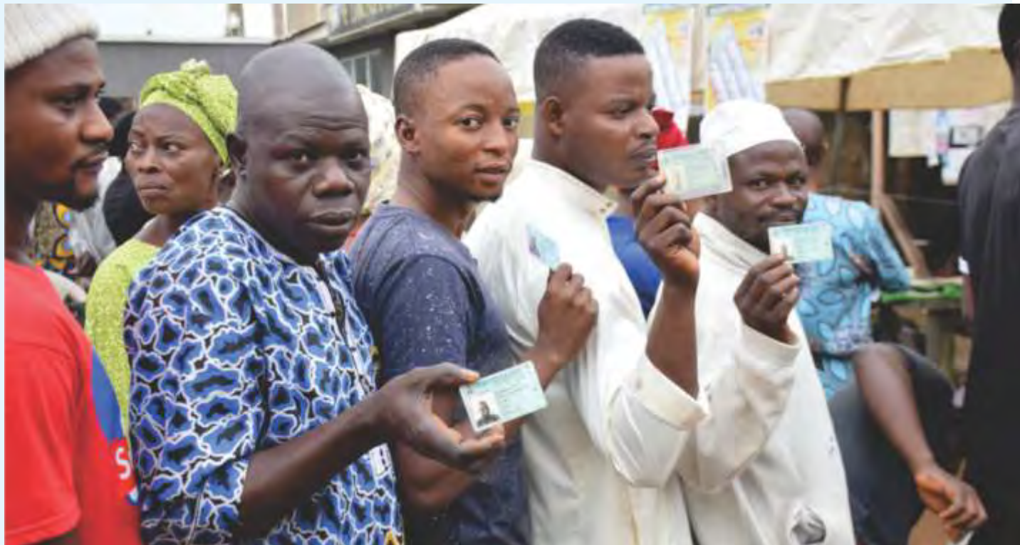
Lagos Voters displaying their PVCs

To further ameliorate the difficulty after