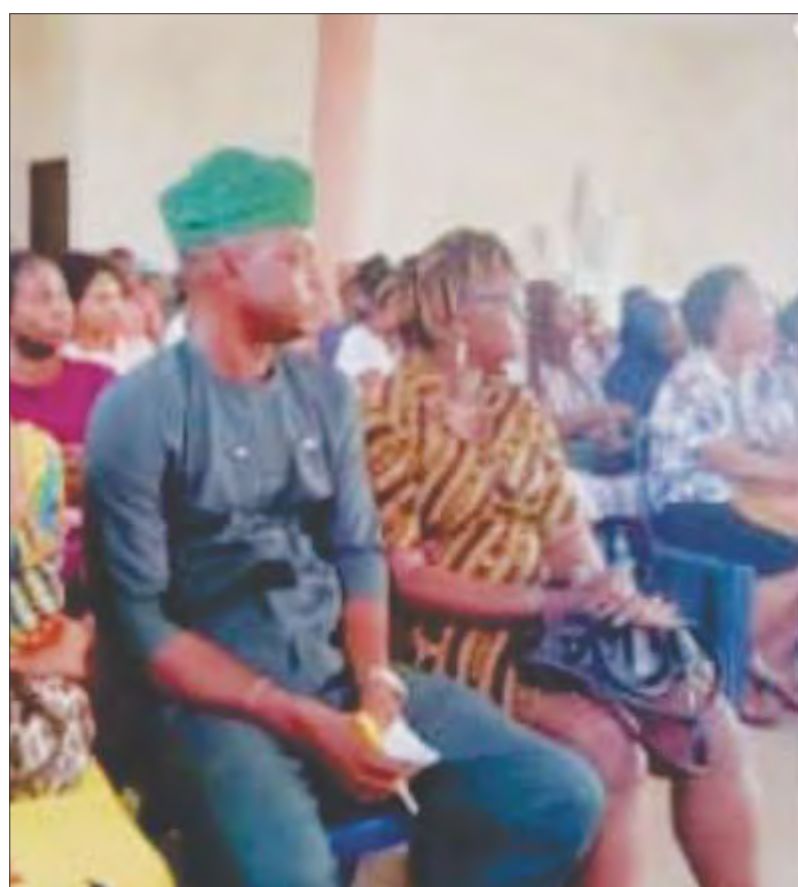
Hamzat commends Revenue staff effort on IGR