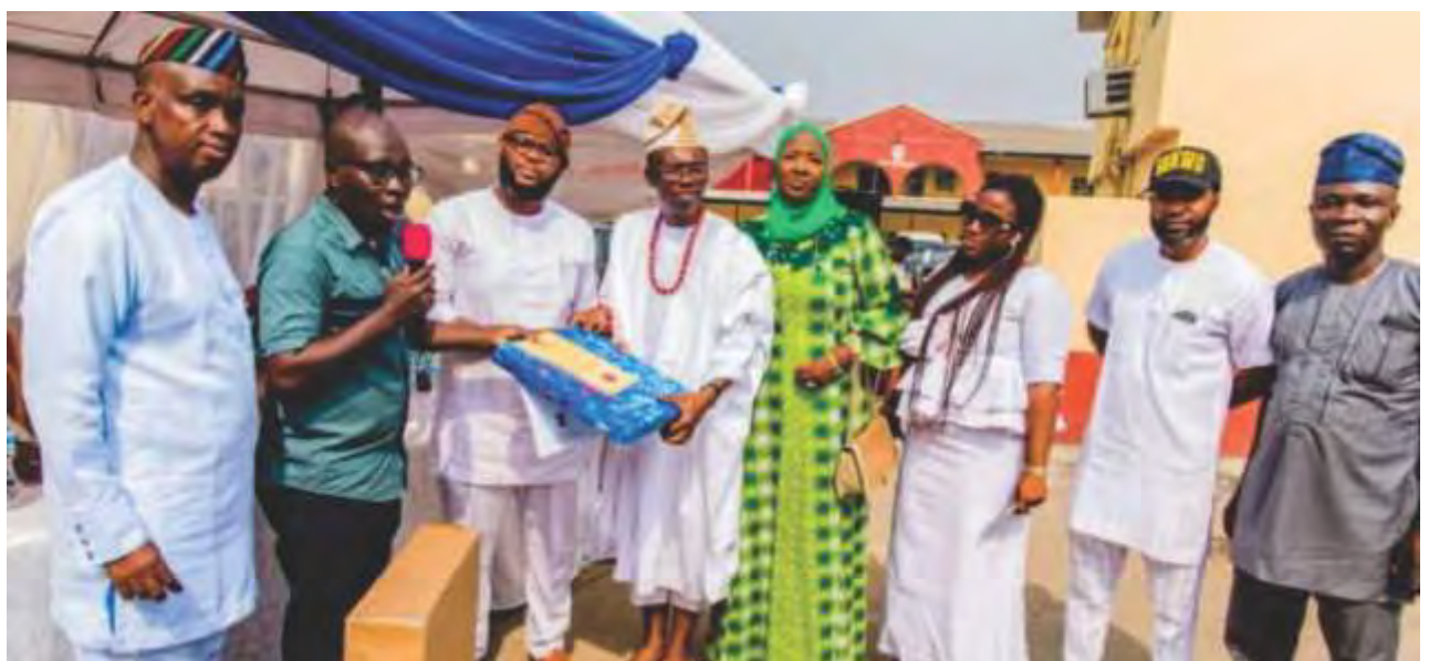
Kosofe staff retirees

"I promise to meet up with your demands and make your welfare paramount."