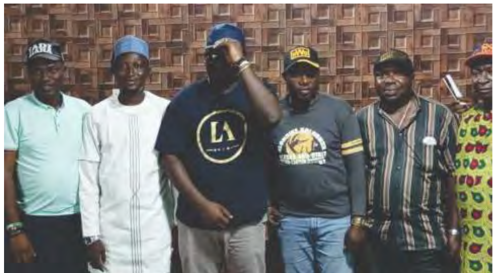
Low Cost Housing Estate, Isolo, Estate Youth

He highlighted that previous demands from the government such as street lighting, and primary school reconstruction among others would be revisited to ensure approval from appropriate authorities. To ensure the productivity of all scheduled programmes for the year, the group appealed to philanthropists and government for support for the group to achieve its goals.