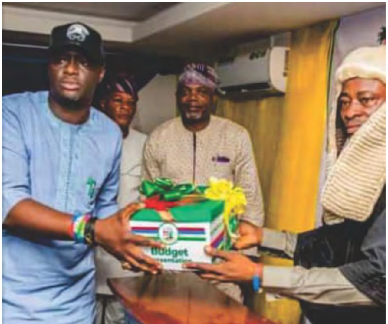
Kosofe N 3.8B budget presentation

He, therefore, appealed for meticulous implementation of the budget.