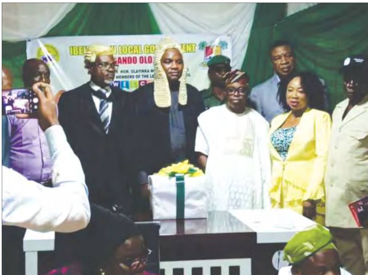
Ibeju-Lekki Legislative and Executive Arm in a group picture

continue to fulfil their mandate both at the wards they represent