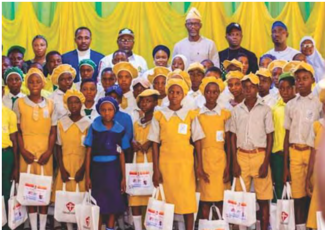
Students at the sensitization programme

efforts in developing the council's education sector among its peers. He revealed that the initiative is set to find common grounds for key stakeholders in education (government, parents, teachers and students) for the advancement of skill-based education. He added that it organised sensitisation, awareness and re-orientation programme for parents, teachers and students. According to him, the initiative also identifies the best brains through objective procedures and collaborates with significant others for scholarship placement. "We also organise programmes and activities that will attract students into STEM education, see to psychological well-being and adjustment of parent-