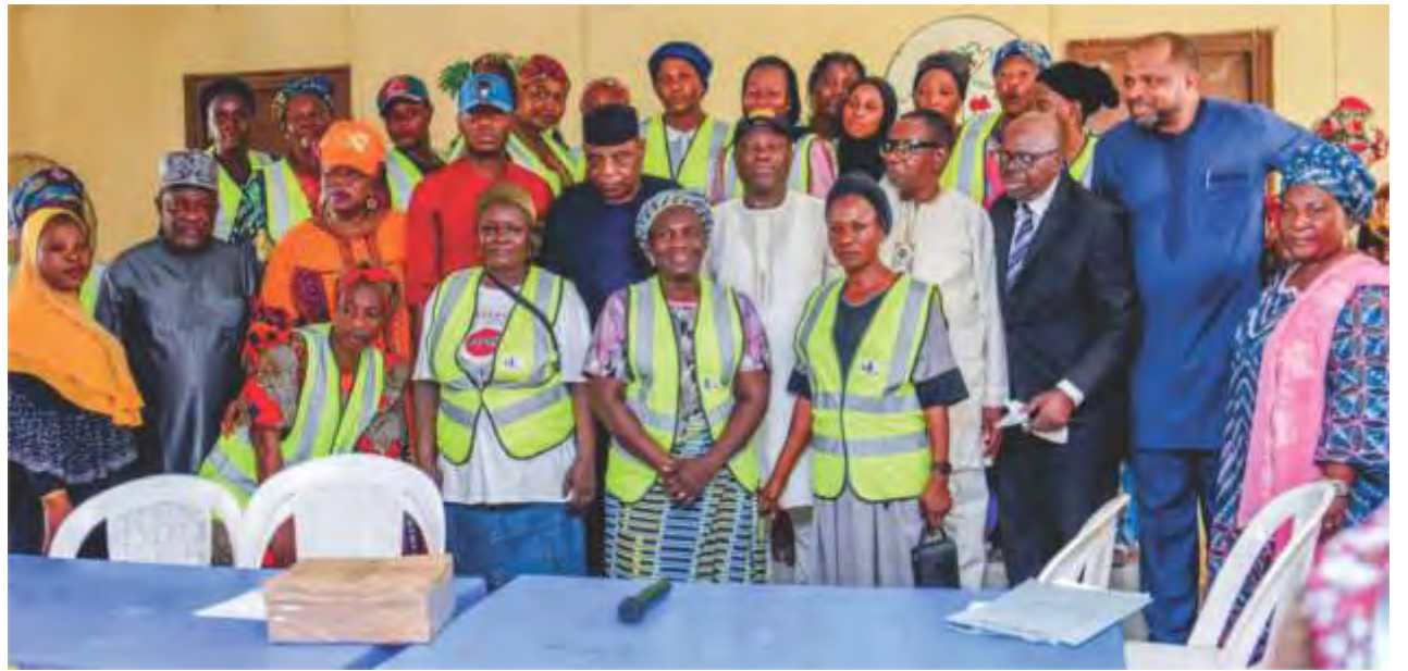
Campaigners with Council chairmen and party leaders