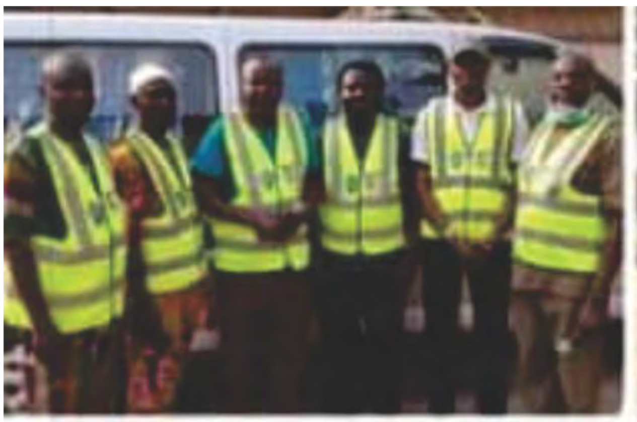
Ifako-ijaiye CDC sensitizes residents on PVC collection

Part of the areas visited was the Mechanic Village site at Obawole and artisans were urged to go for their PVC collection to avoid disenfranchisement due to lack of voting card.