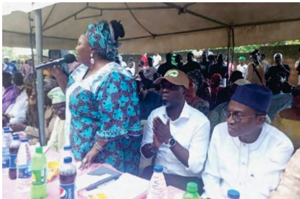
Ojodu APC meeting