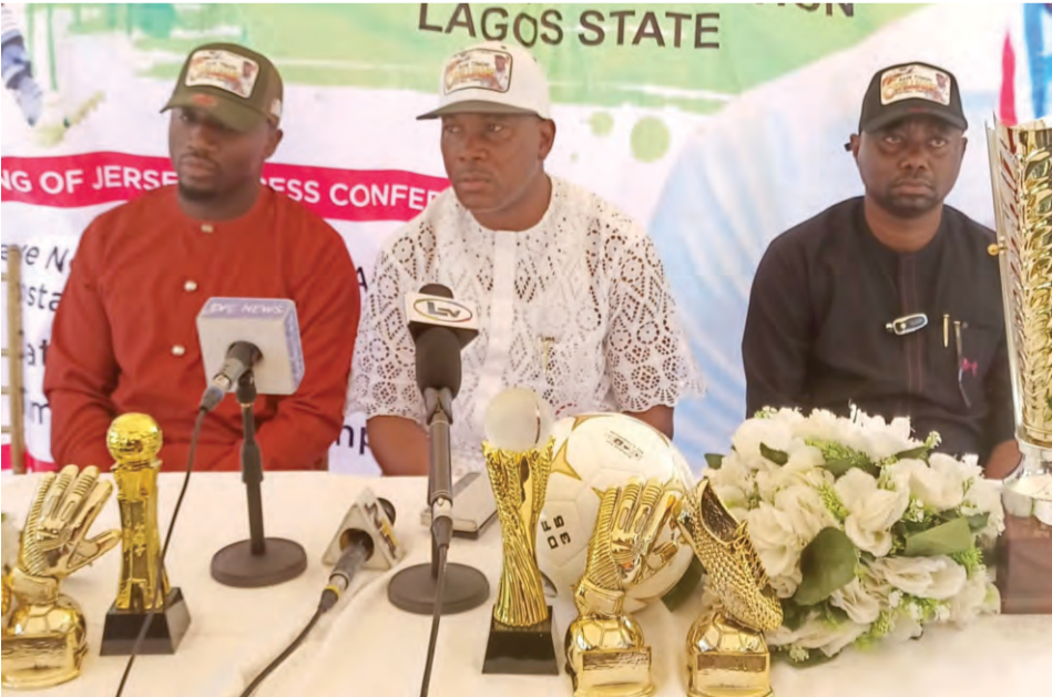
Aare Tomori Williams Cup

impressed with the success of the tournament so far. "I also want to use this medium to appeal to these young players to remain focused in their career and shun drug abuse because it ruins career."