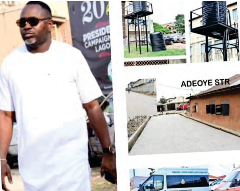
Kendoo promises more projects

invited to the meeting for a robust discussion. The meeting had in attendance notable party leaders from different groups and caucuses within the party. Absent leaders sent their representatives while others tendered apology for their absence.