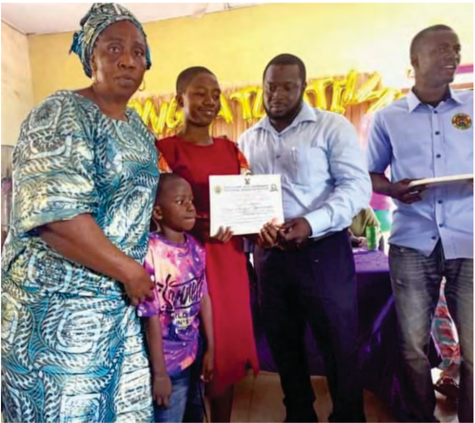
Issuing of certificates