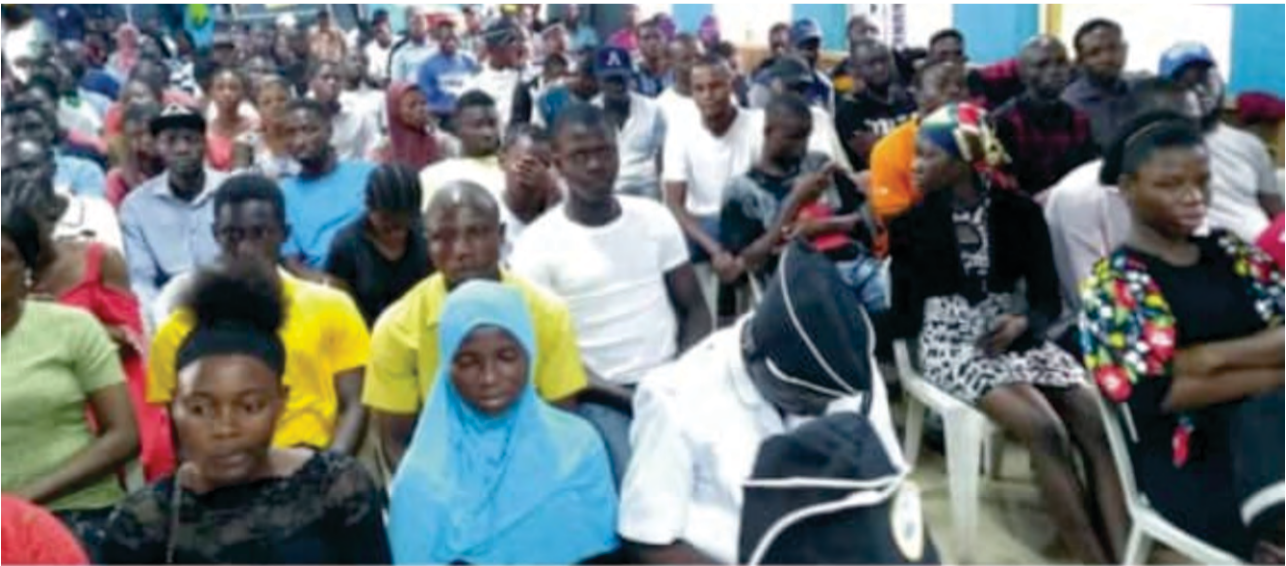
Somolu youths at the meeting

paramount. Orekoya promised to be available at every edition of the youth programme and to support and empower them to become independent. However, the programme also witnessed the inauguration of the Local Government Executives of Orekoya Youth Vanguard