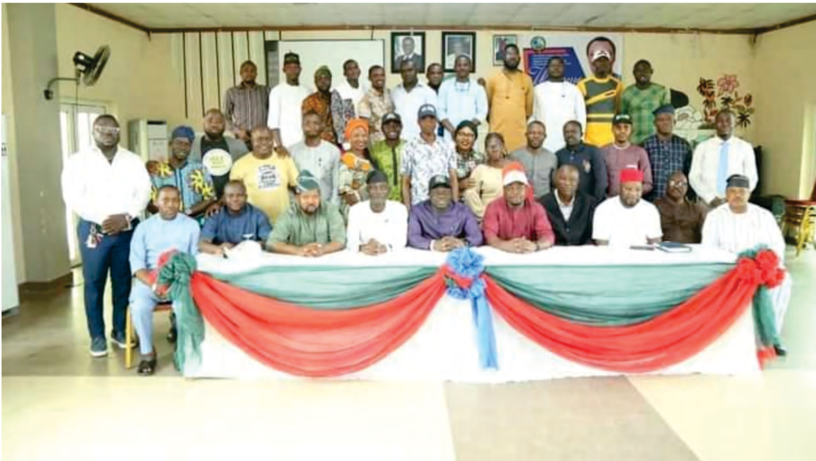
Hon. Valentine with council executives