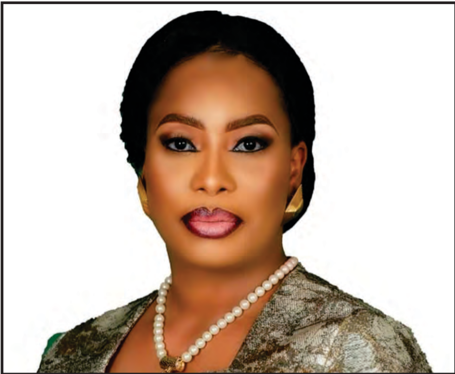
Hon. Mojisola Alli-Macaulay

House of Assembly, representing Amuwo-Odofin Constituency I said that as a female representative, one has to go extra mile in convincing the people as a preliminary awareness have been created, but the capability of each individuals determines their success and support from all. She further encouraged all female aspirants to have their specific aim and objectives and work towards achieving it to distinct them from other candidates.