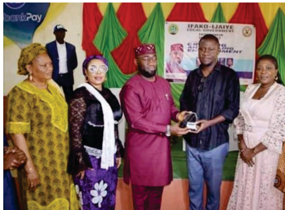
Beneficiaries receiving POS machines