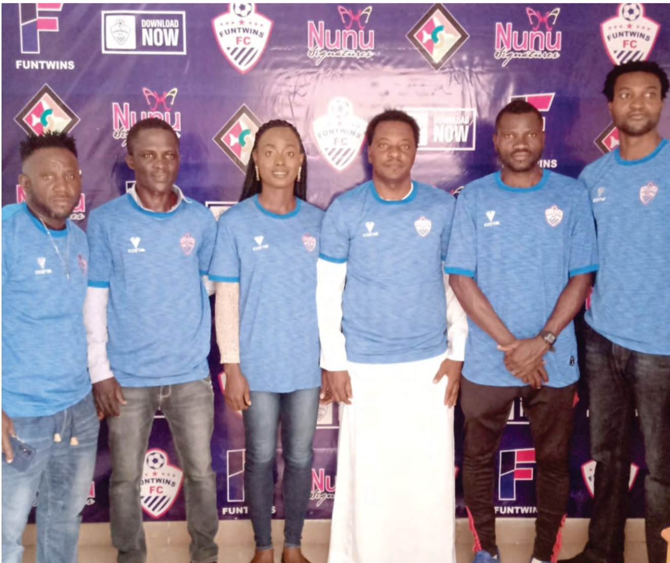
Staffs of Funtwins FC