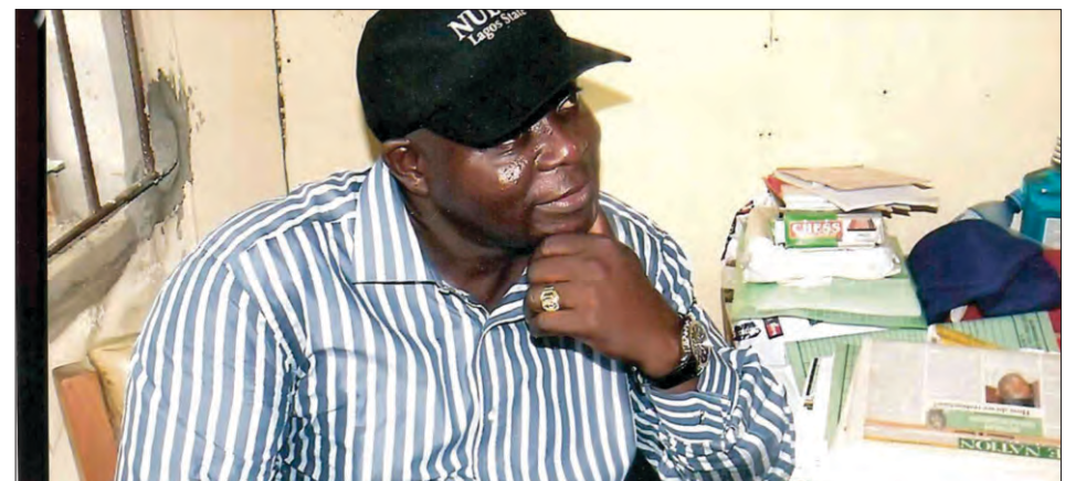
Hon. Lasisi Akinsanya

He urged all residents to pay their council levies, rates and tolls promptly.