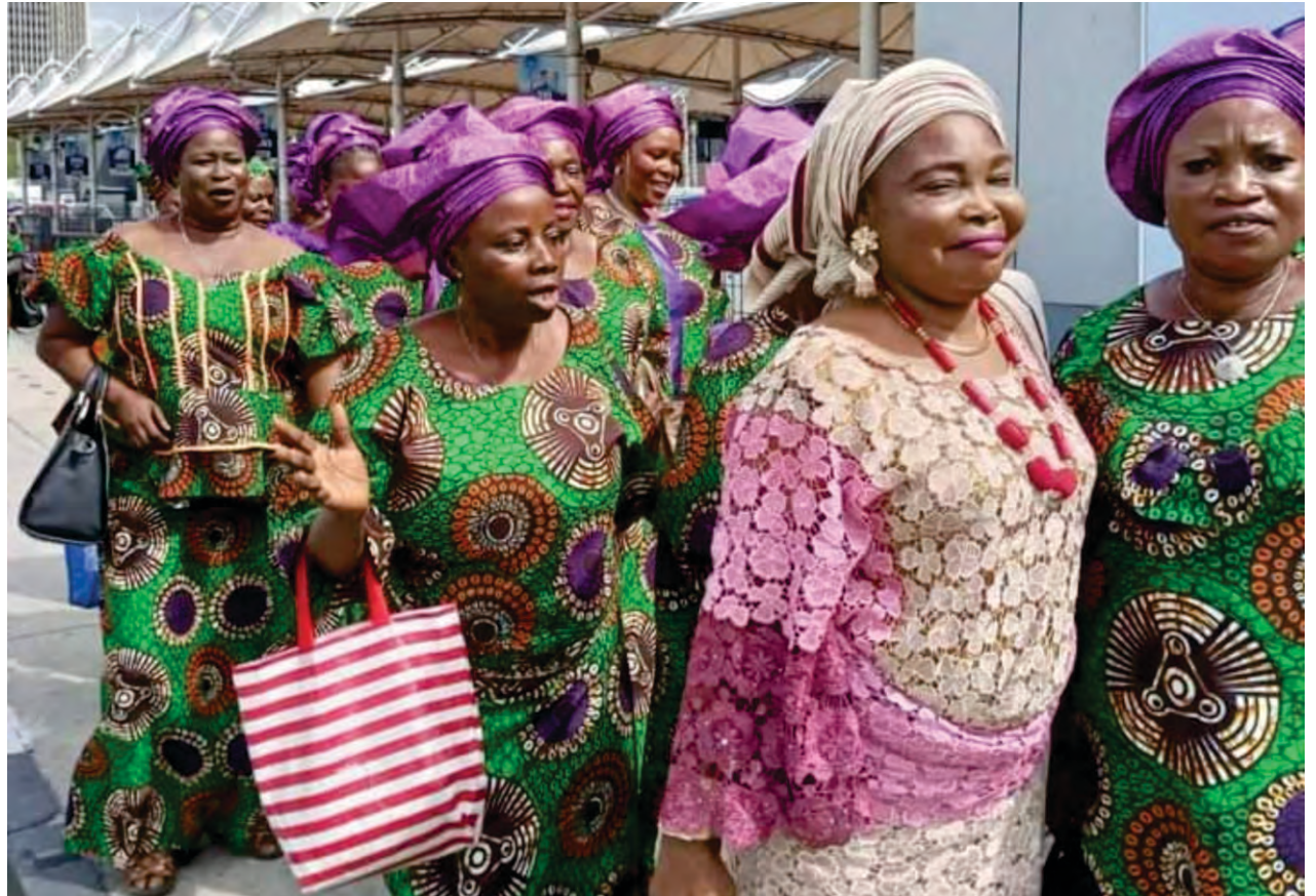
Women folks in Iba LCDA

He, therefore, encouraged Iba women to have more impact that would showcase their selflessness towards community development.