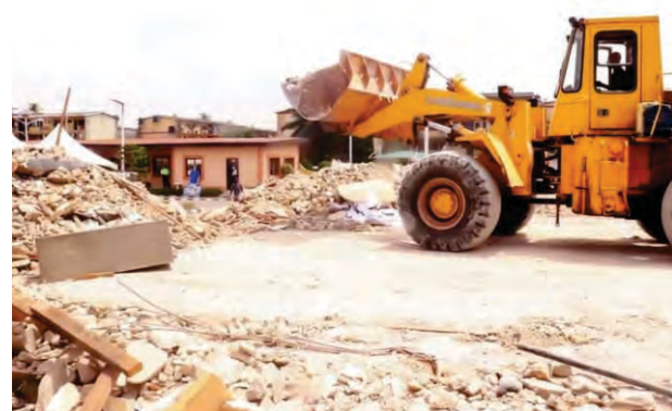
Ongoing demolition of administrative block