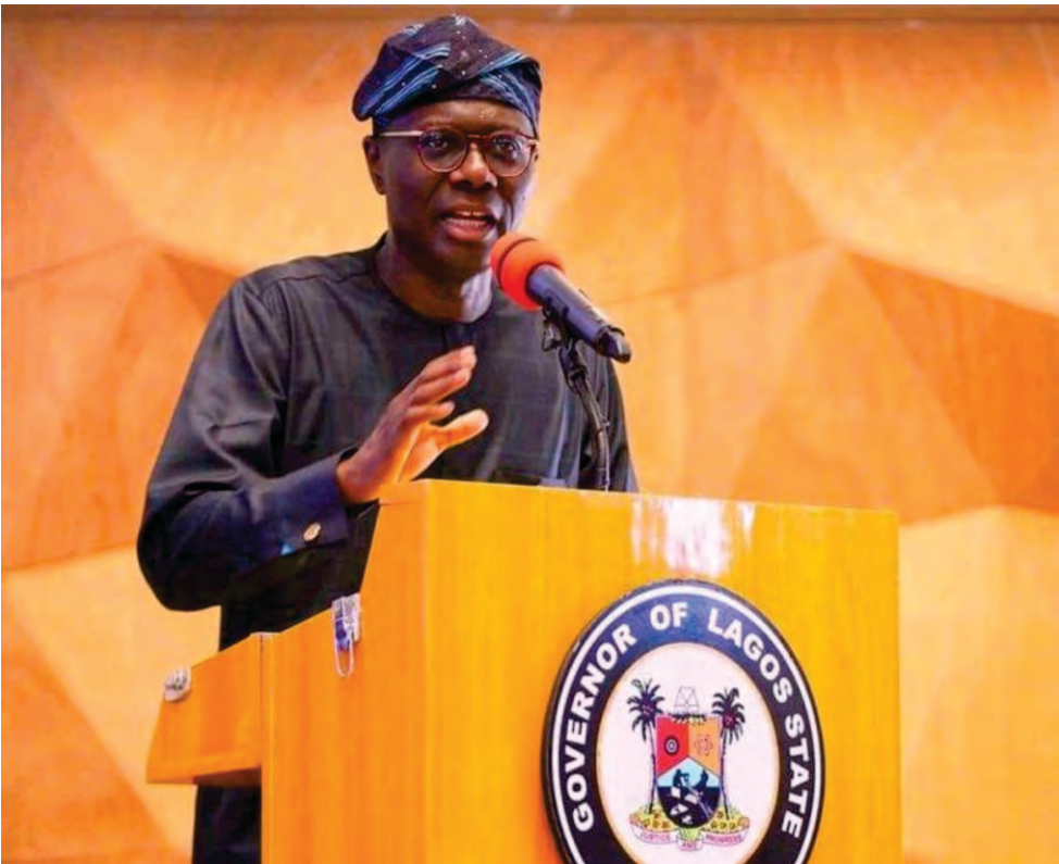
Governor, Babajide Sanwo-Olu

The Special Adviser said: "The appointments are also in compliance with Section 4, Subsection (1) (C) and Section 14 Subsection (1) (A) and (B) of the Lagos State University of Science and Technology Law 2021 and Section 8 Subsection (1) (C) and (D) of the Lagos State University of Education (LASUED) Law, 2021 respectively. "The appointments of Acting Vice-Chancellors and other Management Heads for our new Universities are not only by the laws establishing them, but they will also serve to provide academic and administrative leadership to the Universities, including representing them externally, both within and outside the State."